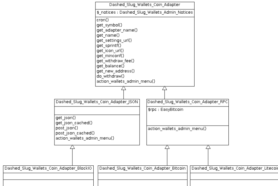
Figure 2: Coin adapters class hierarchy

You do not have to extend directly from Dashed_Slug_Wallets_Coin_Adapter .